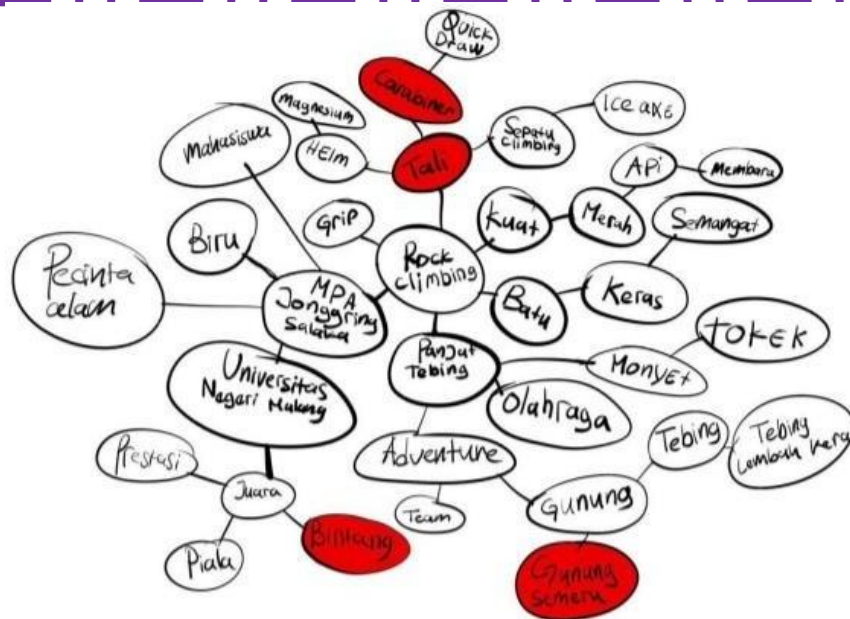
Figure 3. Basic Concept and Visual Keyword Extraction

The logo of the Rock Climbing Division of Jonggring Salaka is designed through the integration of visual elements that are directly related to the organization’s identity, activities, and values. Each element within the logo functions not only as an aesthetic component but also carries symbolic meaning that reinforces the overall visual message.