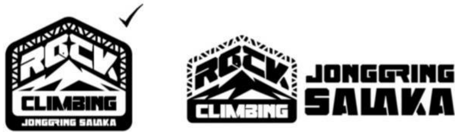
Figure 5. Primary and Secondary Logo Design Results

aspirations for achievement. The secondary logo is designed in a more simplified form, intended for applications in media with very limited space.