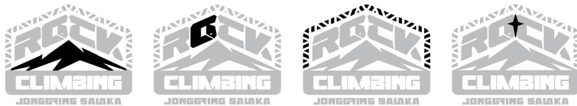
Figure 4. Visual Values

The logo of the Rock Climbing Division of Jonggring Salaka is designed through the integration of visual elements that are directly related to the organization’s identity, activities, and values. Each element within the logo functions not only as an aesthetic component but also carries symbolic meaning that reinforces the overall visual message.