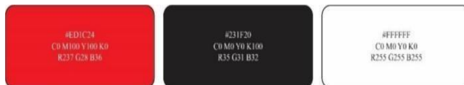
Figure 7. Visual Identity Color Palette

The designer established a color palette consisting of red, black, and white. The color red represents courage, energy, and the athletes' relentless spirit. Black symbolizes firmness and the strength of the division's foundation. White functions as a neutral space that conveys a clean impression. The combination of these three colors was intentionally selected to create a strong level of visual contrast across various promotional media.