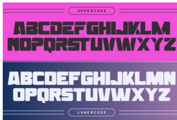
Figure 6. Sport Lane Main Typography

The designer selected the Sport Lane typeface as the primary typography for the visual identity. This typeface appears bold, strong, and dynamic. Its dynamic character aligns with the energetic nature of outdoor extreme sports. The typography also ensures that the division's name remains highly legible, even when viewed from a considerable distance.