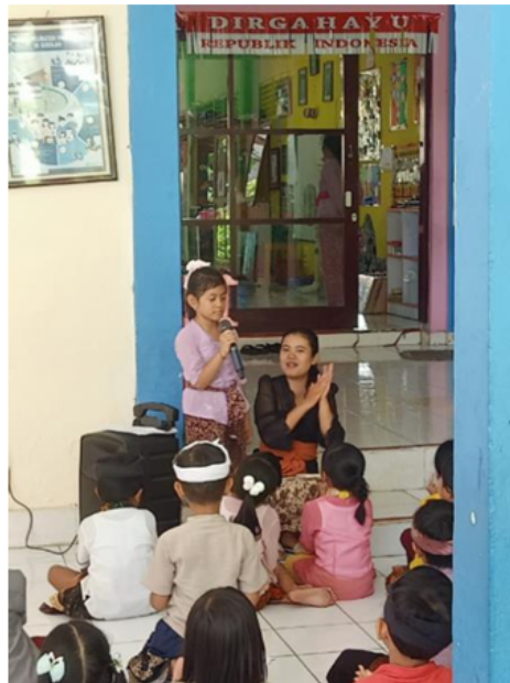
Figure 3. Bali Magending Activities

From a developmental psycholinguistic perspective, the use of regional songs and traditional games strengthens children's phonological, syntactic, and pragmatic abilities. Songs like "gending rare" (gending rare) help children recognize sound patterns and rhymes, while traditional games foster pragmatic abilities through direct communicative interaction. These findings align with research by Anggraini et al. (2019) and Lestari & Prima (2023), which found that a local culture-based approach is effective in strengthening language skills because it involves strong emotional and social elements.