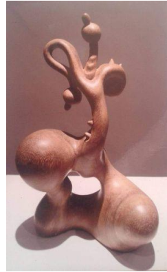
Figure 3. Title: Fantasy

This work presents a sculpture filled with a sense of affection, where the forms of the sculptures appear to be embracing each other lovingly. It was created with attention to aesthetic value and the direction of the wood grain used to support the resulting work. The lines of the wood grain are carefully calculated.