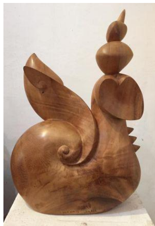
Figure 1. Title: Flying with Dreams

A work is formed from ideas and concepts, and the work has a meaning to be conveyed through its manifestation. In the form of a work of art, it has a role that reflects all the feelings poured out by the author as a form of expression captured directly from the object present in the observation. Through this manifestation each work has its own discussion to communicate to the observer, the sculpture work of artist I Wayan Jana has a very modern style that seems elastic and dynamic by displaying the form of living creature figures such as humans and animals, the style displayed distorts the original form into the form of the artist's own imagination, with such compositions the resulting sculptures are inseparable from the aesthetic values presented in each work created.