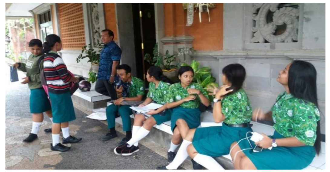
Figure 4. Every Saturday, Students Are Required To Speak Balinese (Source: https://www.nusabali.com/berita/3119/tiap-sabtu-wajib-berbahasa-bali)

In this pattern there is feedback (feedback) for the teacher, there is no interaction between students (communication as interaction). Communication interaction or two-way communication, the teacher and students can acts as the giver of the action or the recipient of the action. In this interaction, a teacher uses the lecture and question and answer method. Question and answer method is a method of teacher asking questions while students answer about material that they want to obtain. Or conversely, students ask questions to the teacher from the explanation of the material that is not yet understood by students and the teacher provides a comment or explanation as an answer to the question earlier.