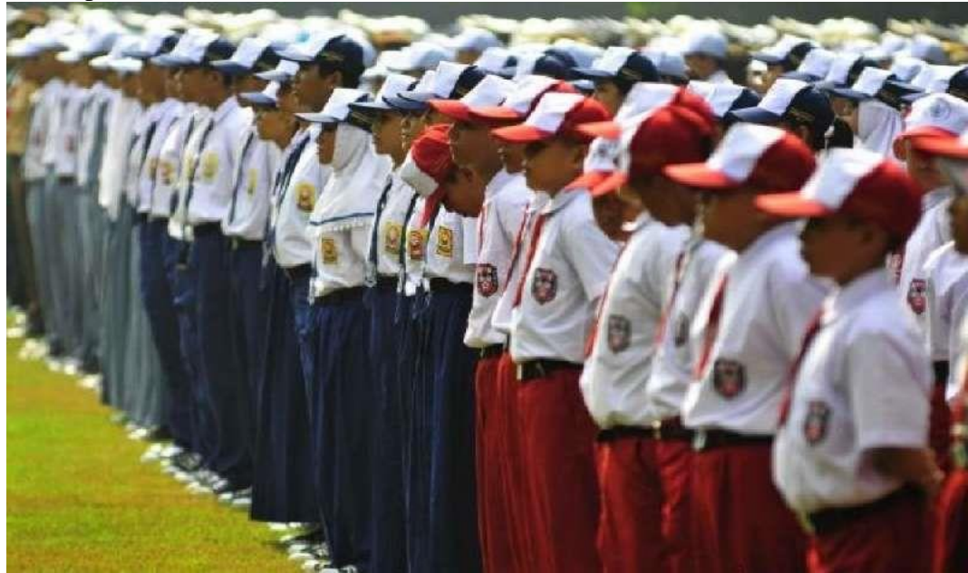
Figure 1. Students Are Lining Up

Education is not merely aimed at teaching subjects, but it educates, raises and develops the child's personality. Education is