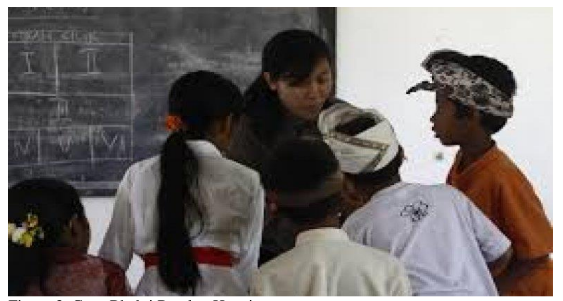
Figure 3. Guru Bhakti Road to Happiness

The pattern applied in teaching and learning interactions is one effort to achieve educational goals. The purpose of education will not be achieved if the interaction of teaching and learning never takes place in education. Teachers and students are two important elements directly involved in education. Interactions carried out for teachers to use various patterns. The teacher still uses the direct learning model so students assume that the teacher will tell students what they need to know (Vrihastien, Widodo, & Ayuningtyas, 2019).