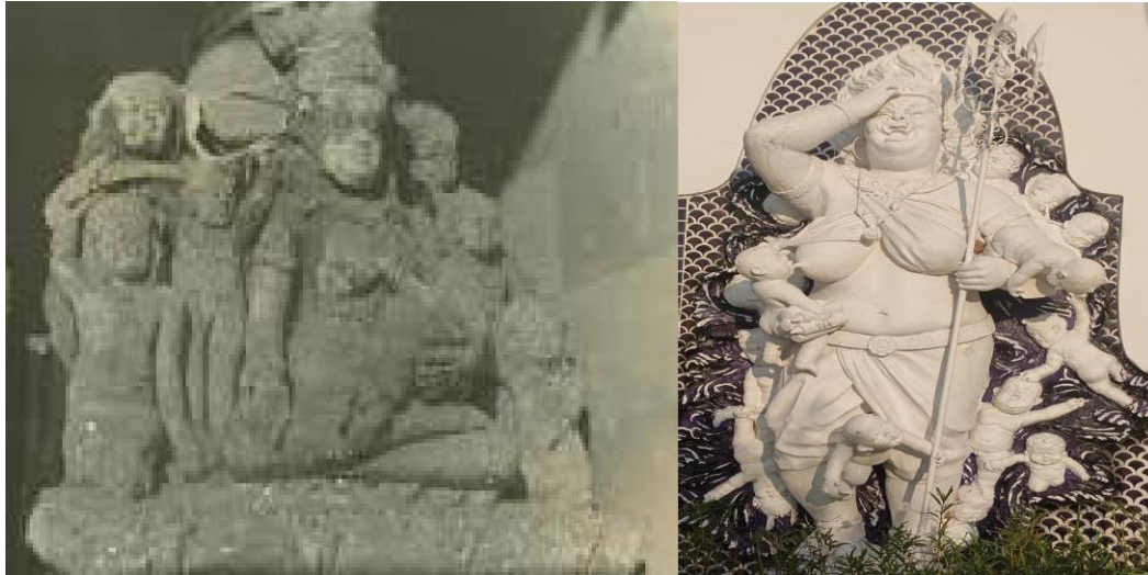
Picture 2: Men Brayut Statue at Goa Gajah Temple, Gianyar, Bali (Left); Men Brayut Statue Statue in Khong Khen Province, Thailand (Right)

Sign," a form of "speech type" carried through discourse. Myths cannot be described through the object of the message but rather through the manner of the message (Rafiek, 2015)—Barthes revealed that myth is a message, not a concept, idea, or object. Here, Barthes wants to explain that reading an image as a symbol means releasing its reality as an image. (Suaka, 2020, p. 305).